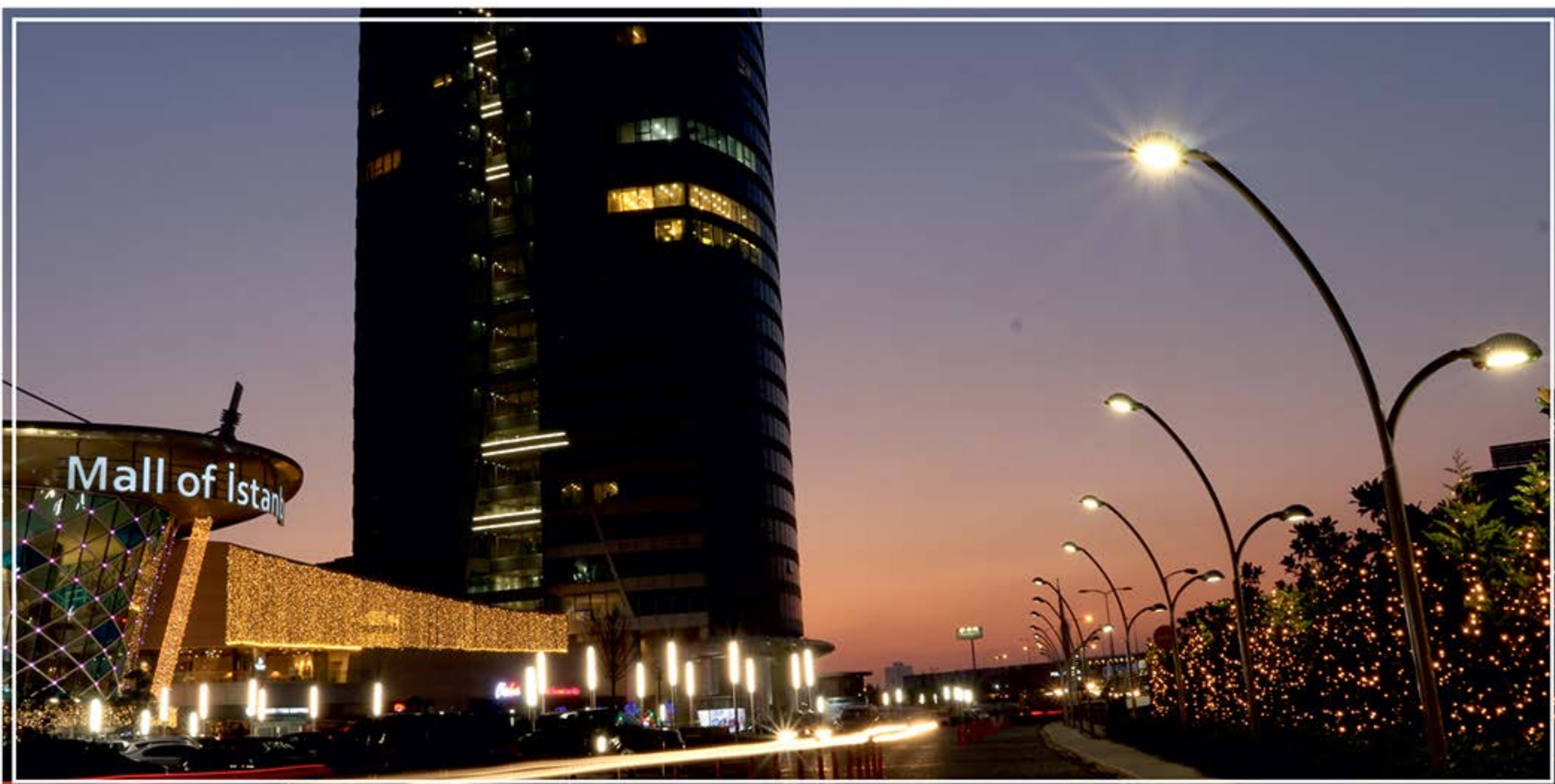
Mall of Istanbul. Istanbul / Turkey

*CRI>70: Power Factor >95, Drive current 350 ma-1050ma