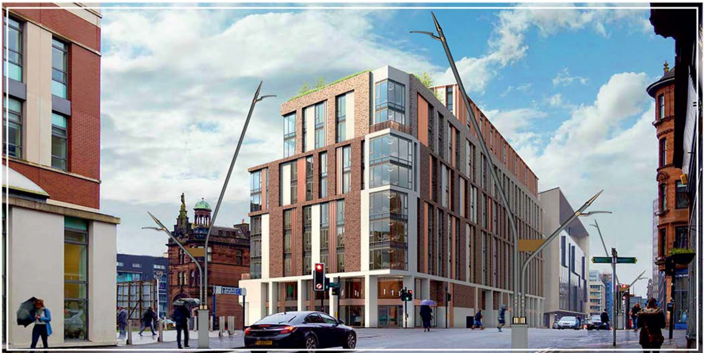
1 Visual Realisation

*CR>70: Power Factor >95, Drive current 350 ma-1050ma