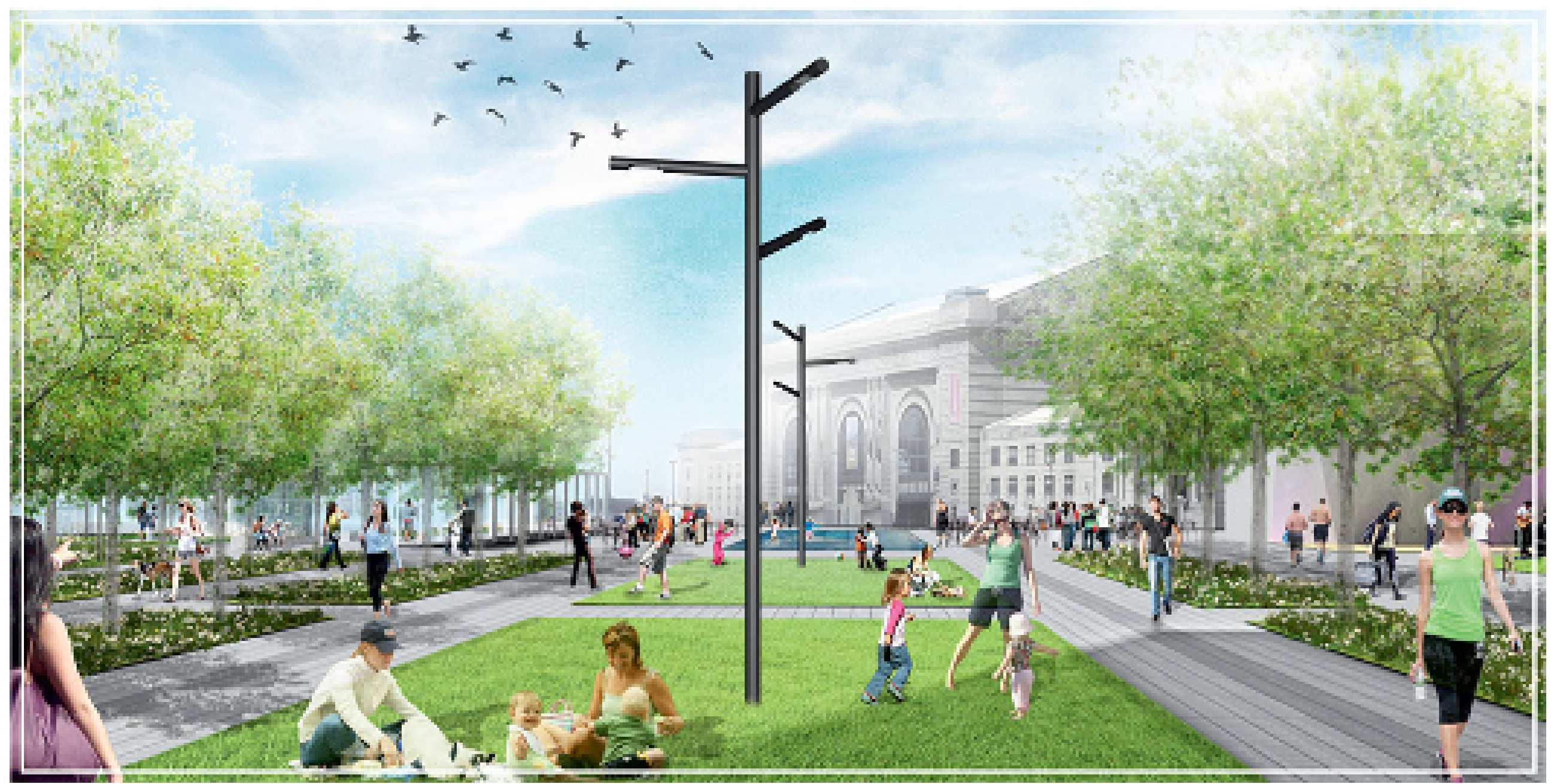
Visual Realisation |